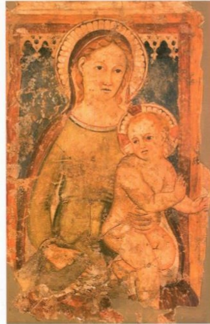
MARY QUEEN OF PEACE

Pontifical Council for Justice and Peace Vatican City