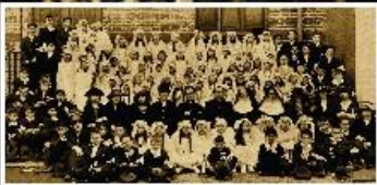
First Holy Communion, 1920