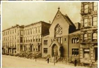
Our Lady of Peace, Founded 1918